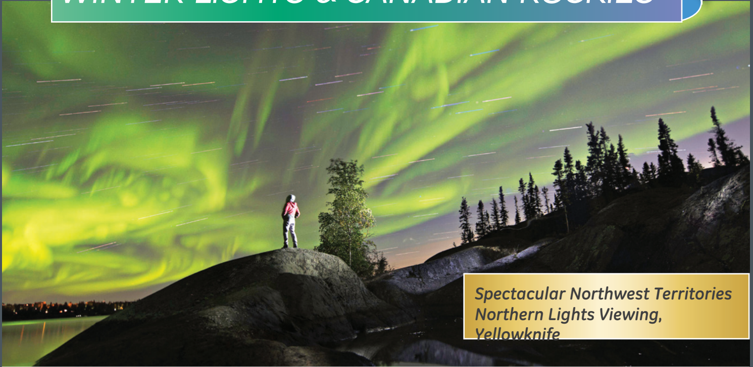
Spectacular Northwest Territories Northern Lights Viewing, Yellowknife