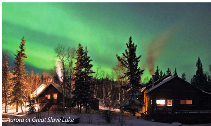
Aurora at Great Slave Lake