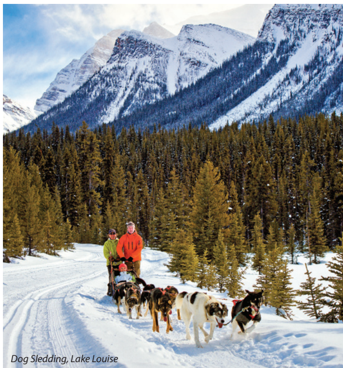
Dog Sledding, Lake Louise