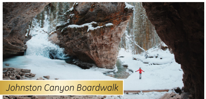
Johnston Canyon Boardwalk