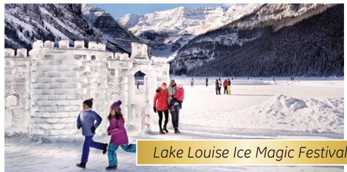
Lake Louise Ice Magic Festival