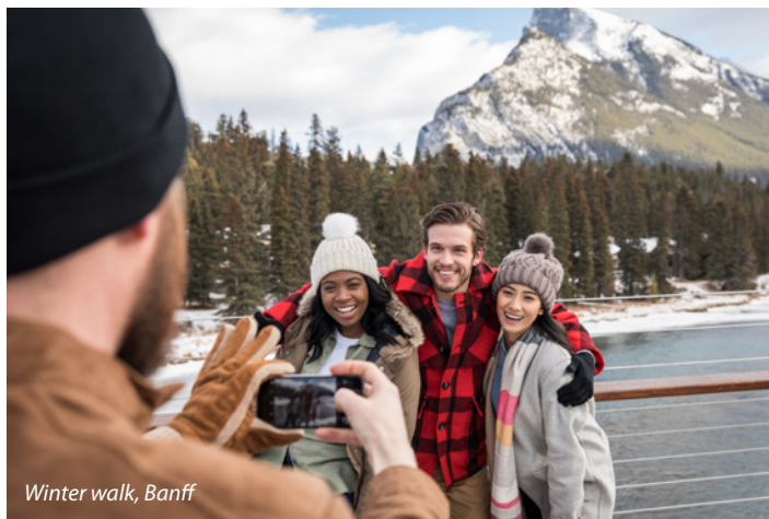
Winter walk, Banff

Not included: Flights – call us for best available airfares at time of booking, any meals, tours or services not listed as included.