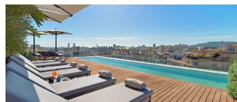
Table Bay Hotel is a 5 star luxury hotel situated at the V&A Waterfront and boasts beautiful views of the working harbour, Table Mountain and the Atlantic Ocean.