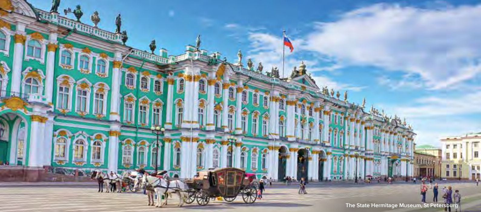
The State Hermitage Museum, St Petersburg