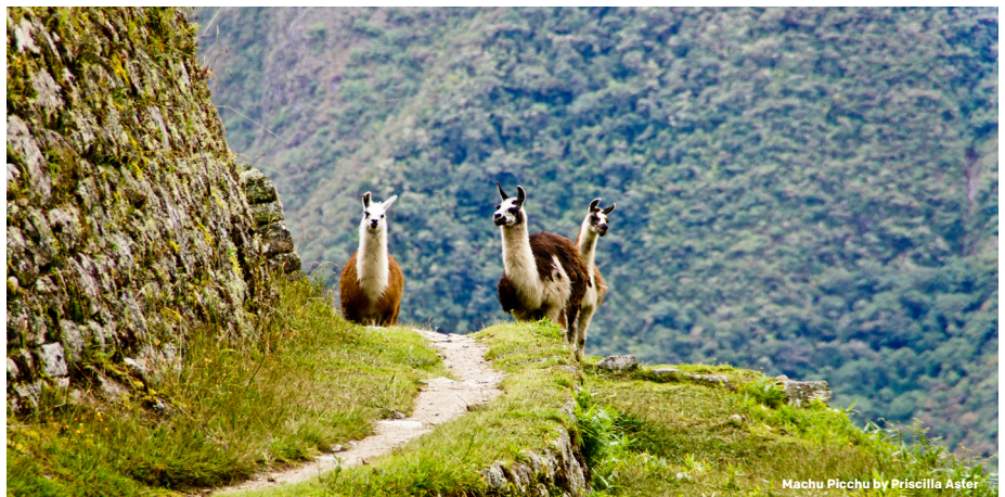
Machu Picchu by Priscilla Aster

Please speak to your travel consultant for day by day itinerary, departure dates and more details.